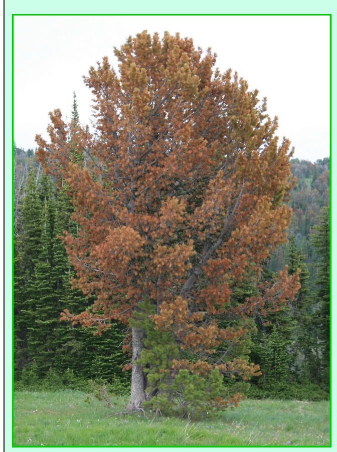
All needle ages faded or red. Tree will die.