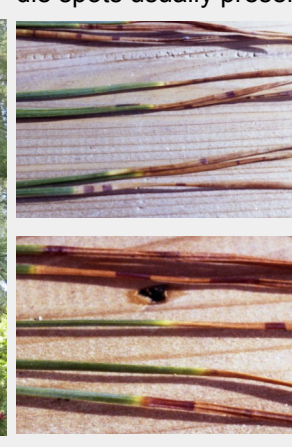
Close up of needle spots from foliar disease.