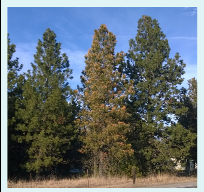
Hauser, ID on January 26, 2015. Nearby trees often unaffected, only 2014 needles turn yellow. The elevation is approximately 2100 feet.