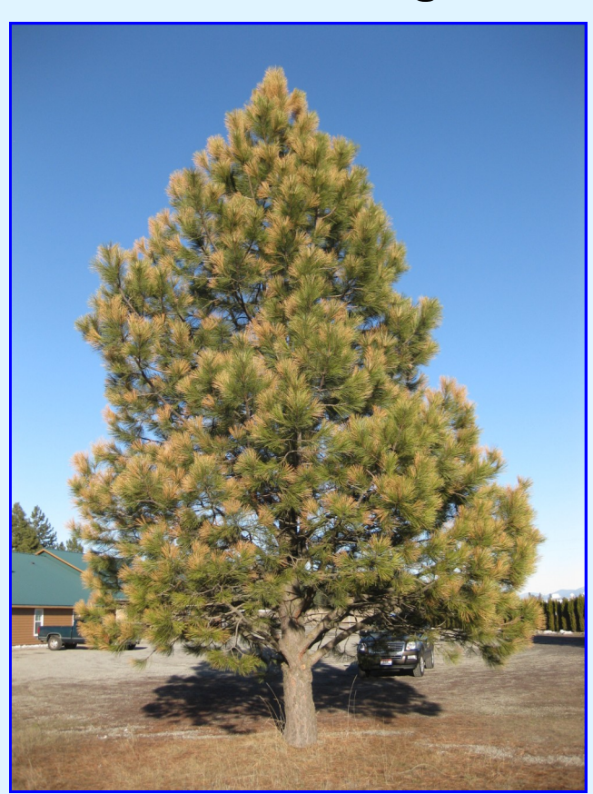
Only 2014 needles damaged. Tree will flush new growth.