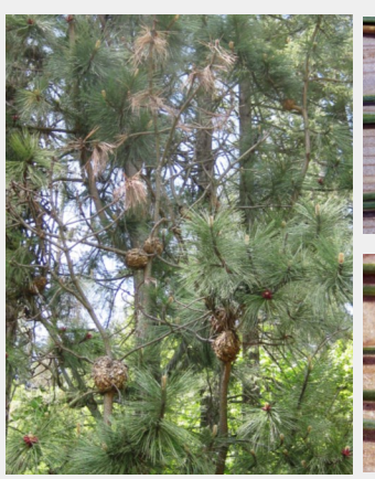
Close up of western gall rust galls that can cause branch flagging.