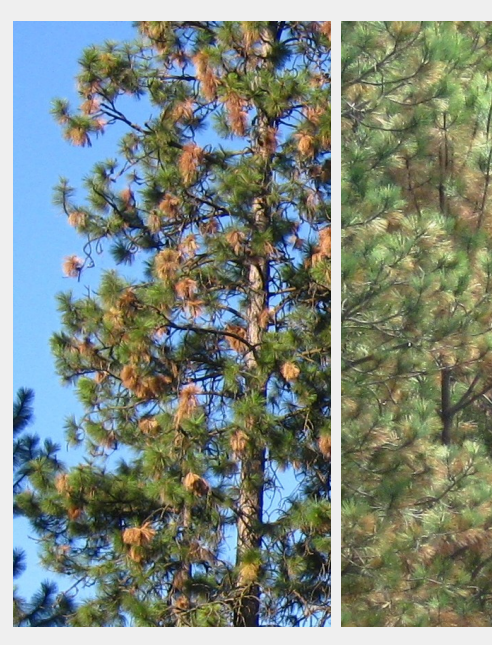
Western gall rust causes branch flagging, killing needles on individual branches. Caused by gall on the branch.