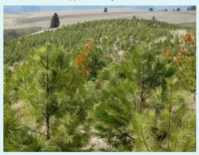
Gifford, ID on February 19, 2015. This photo shows the scattered nature of the damage in this plantation at approximately 2800 feet elevation.