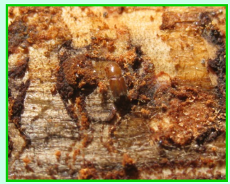
Beetles and/or galleries under bark. Phloem brown, frass present.