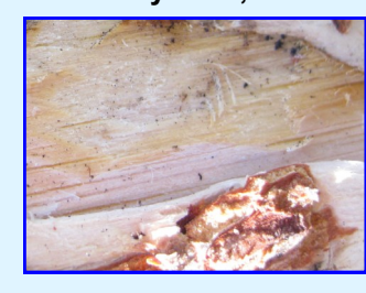
No staining in xylem.