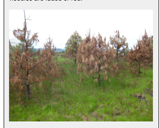
Kamiah , ID . This photo shows typical bark beetle damage in a ponderosa pine plantation.