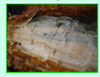
Blue staining in xylem from bark beetles.